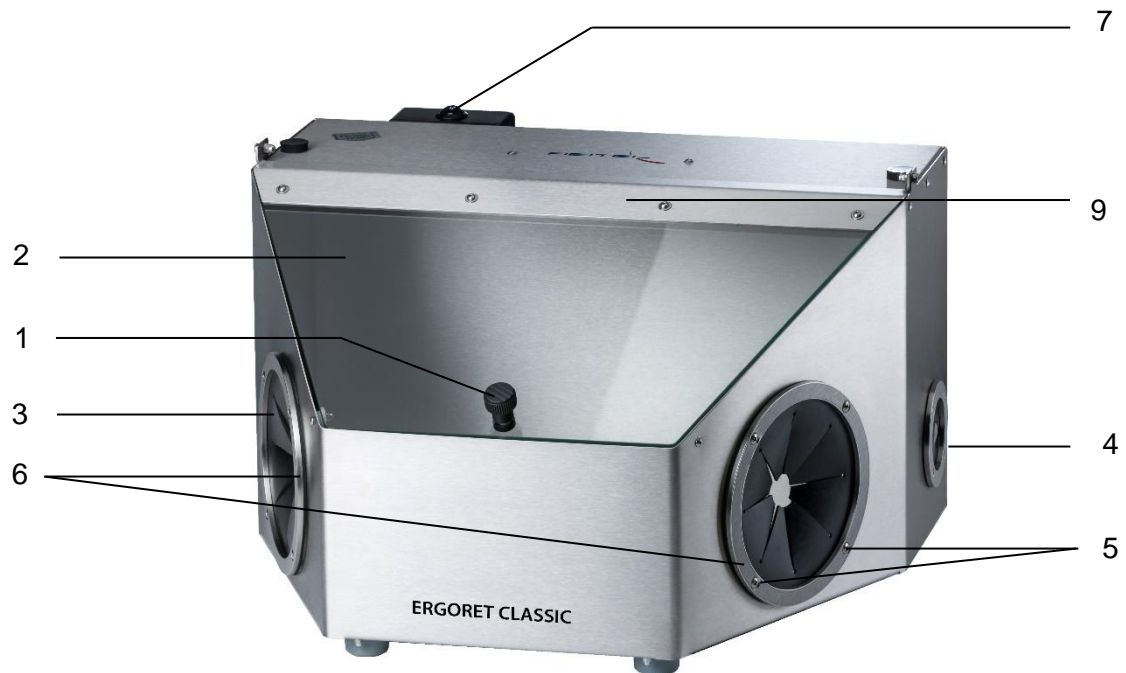
Fig.: Side view