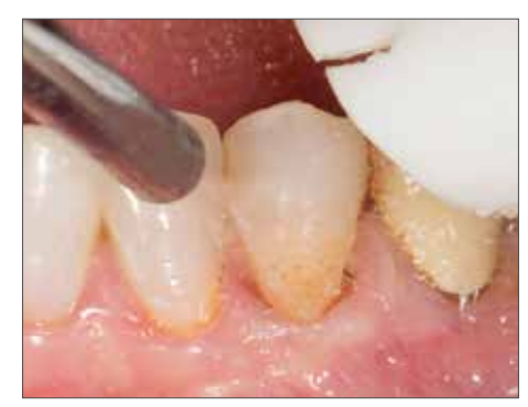
Apply a firm air/water spray to remove residual coagulum.