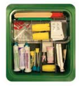
Crown and Bridge