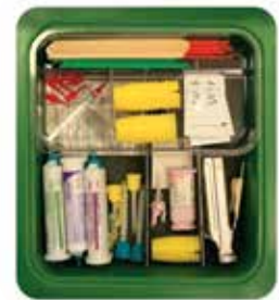
Crown and Bridge