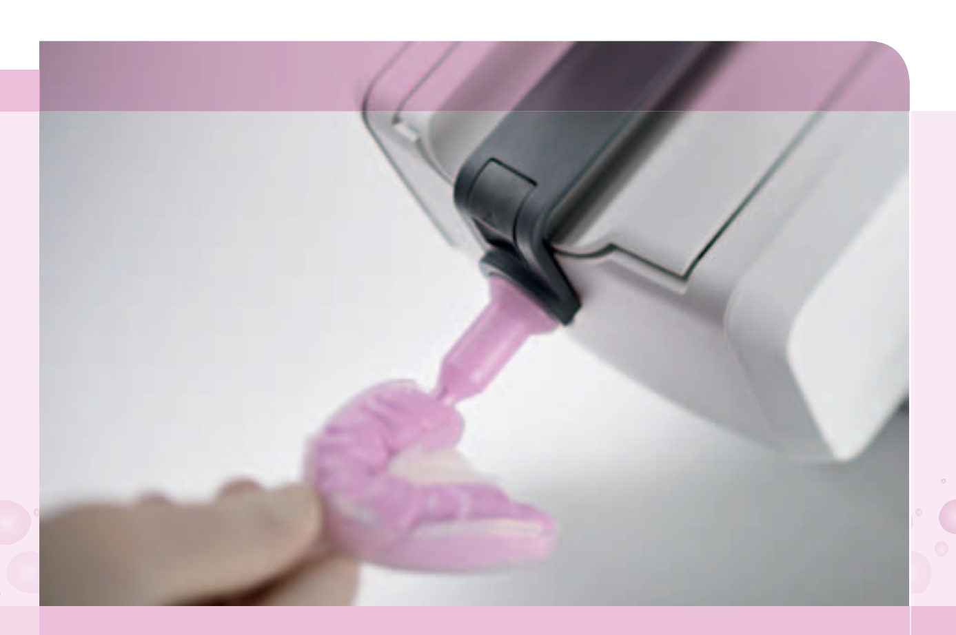
Your alginate indications deserve the best