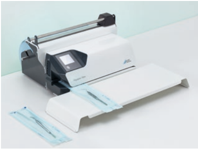
Instrument table and table-top Hygofol Station