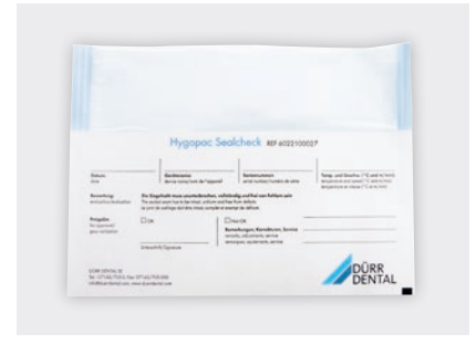
Hygopac Sealcheck, daily seam sealing test